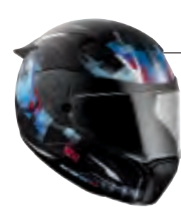
New colour scheme: Black Matrix

For helmets to deliver maximum safety, they must combine a number of different functions. As expected, the Race helmet is exceptional when it comes to impact absorption. In addition though, it enables riders to concentrate fully on the road ahead, and to react at lightning speed.