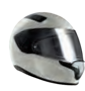
Colour: White Metallic