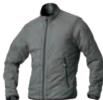
Thermal inner jacket included with all jackets