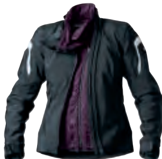
Women's cut, Black/Plum