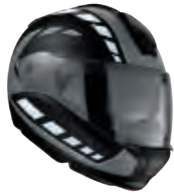
Colour scheme: Dynamic