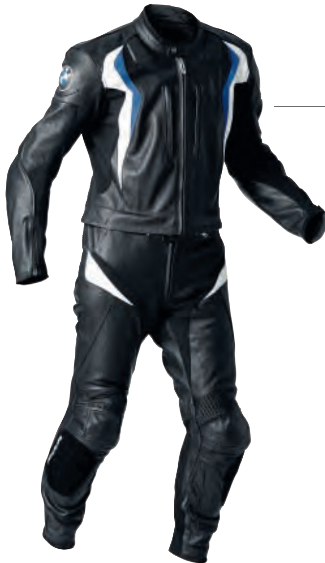
Men's cut, Black/Blue