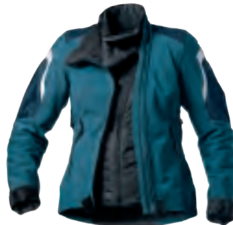
Women's cut, Deep Sea/Black