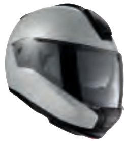
Colour: White Silver Metallic