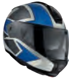
Colour scheme: Spirit