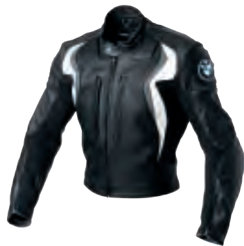
Men's cut, Black/Grey

This leather suit is the perfect introduction to the world of motorsport. 100% cowhide nappa leather, stitched-in protectors, and a number of leather and aramid stretch inserts ensure a streamlined, comfortable fit. As such, it is ideal for short trips and longer tours alike.