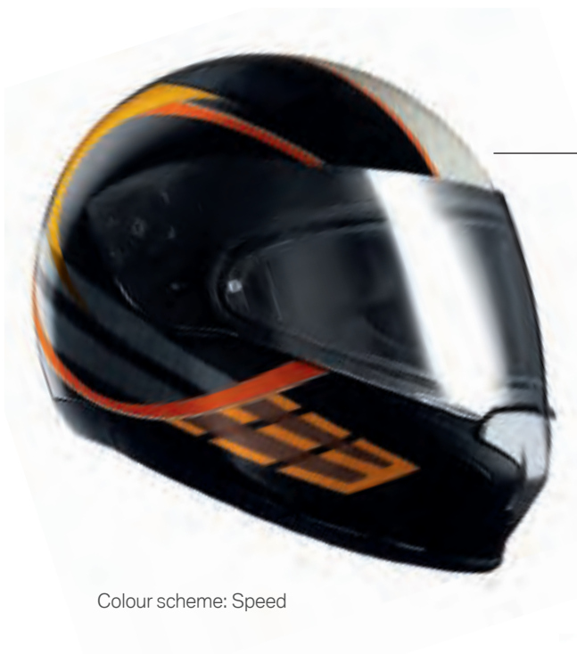
Colour scheme: Speed