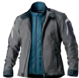
Men's cut, Mineral Grey/Deep Sea