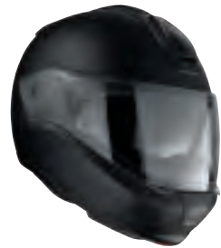
Colour: Jet Black Matt