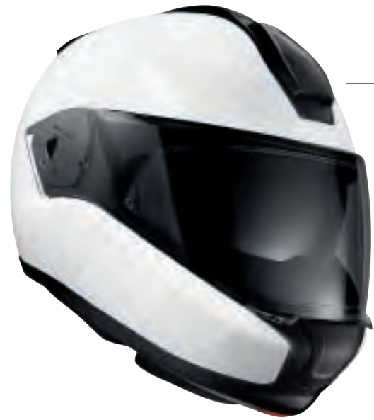
Colour: Brilliant White