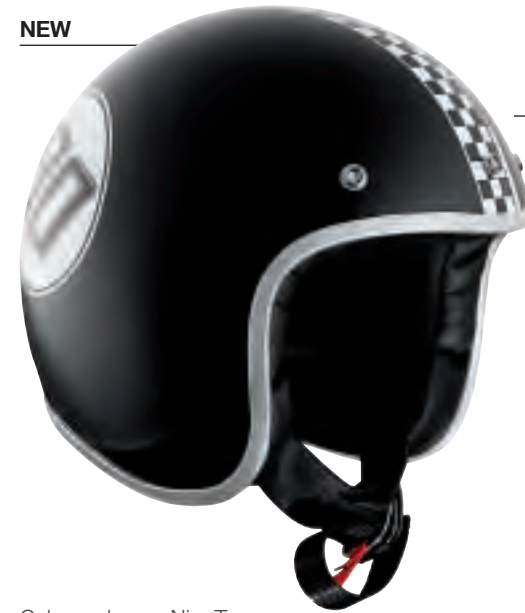
Colour scheme: NineT