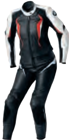
Women's cut, Black/Red

This leather suit is the perfect introduction to the world of motorsport. 100% cowhide nappa leather, stitched-in protectors, and a number of leather and aramid stretch inserts ensure a streamlined, comfortable fit. As such, it is ideal for short trips and longer tours alike.