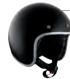
Colour: Blackstorm Metallic

With classic styling, high-quality leather, and no visor, the new, uncompromising Legend helmet means business. There's no doubting its safety performance either, thanks to first-rate impact absorption and integrated neck straps. Matching goggles and an optional sun shield complete the timeless look.