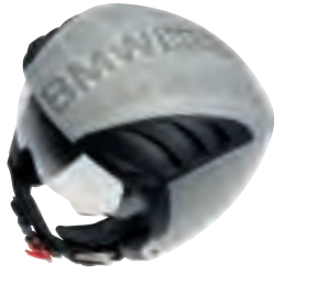
Colour scheme: Logo