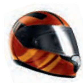
Colour scheme: Magma