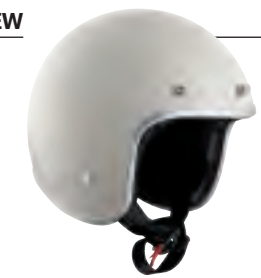
Colour: Alpine White