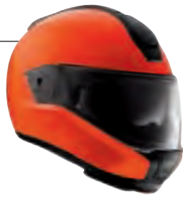
New colour: Fluorescent Orange