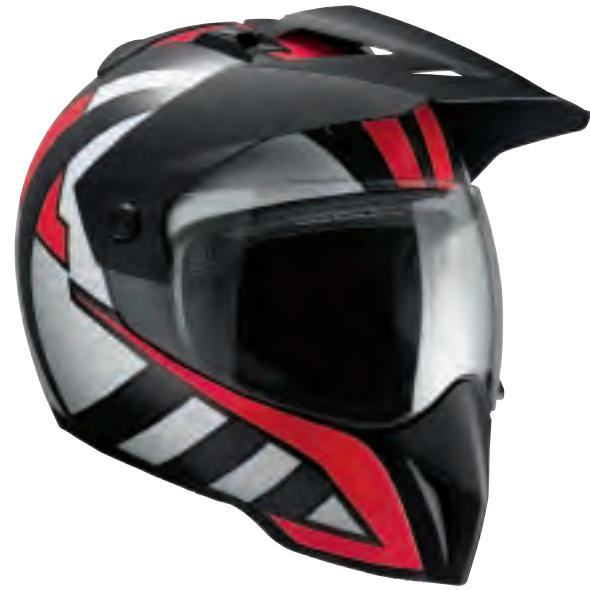
Colour scheme: Crow Edge