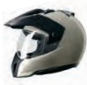
Colour: Magnesium Matt