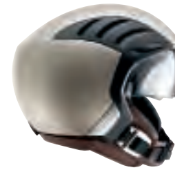
Colour: Magnesium Matt