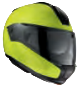
Colour: Fluorescent Yellow