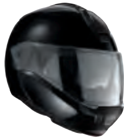
Colour: Sapphire Black Metallic