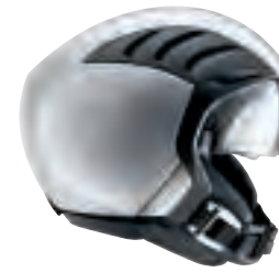
Colour: Titanium Silver