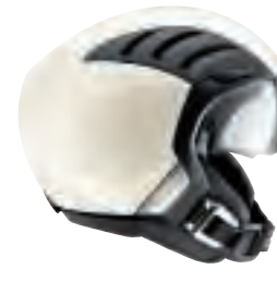
Colour: Light White