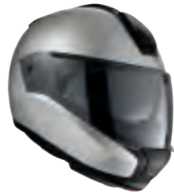
Colour: Titanium Silver Metallic