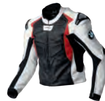
Men's cut, Black/White/Red