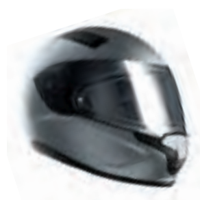
Colour: Granite Grey Matt