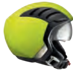
Colour: Fluorescent Yellow