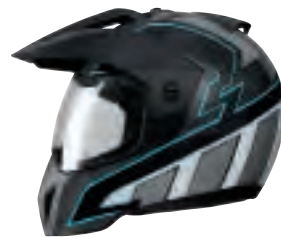
Colour scheme: Bullit Blue

This helmet satisfies all the requirements of an enduro sport helmet from BMW Motorrad. Along with optimum fit, it delivers excellent aerodynamics and of course maximum safety for the rider. Optional accessories: lining and cheek pads in a range of sizes, tinted visor.