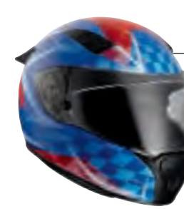
New colour scheme: Torque