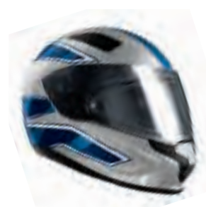
Colour scheme: Sparc