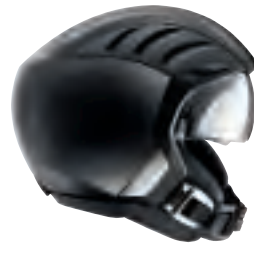
Colour: Night Black