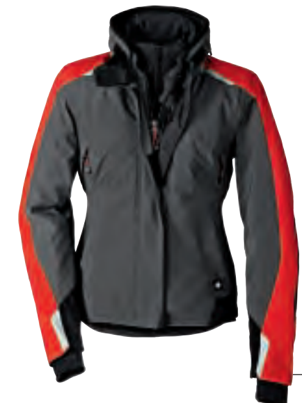
Short jacket, men's cut, Anthracite