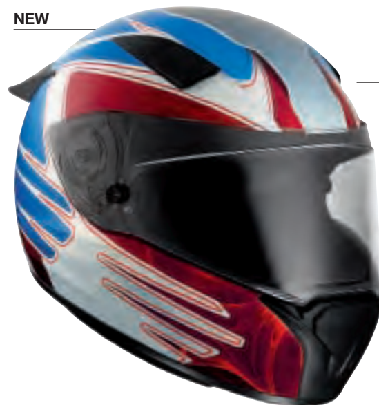
New colour scheme: Competition