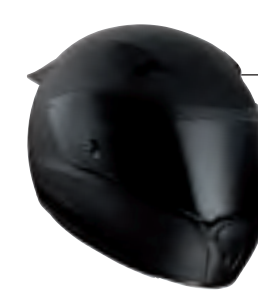
New colour: Black Matt