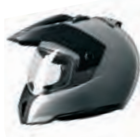
Colour: Dark Grey Matt